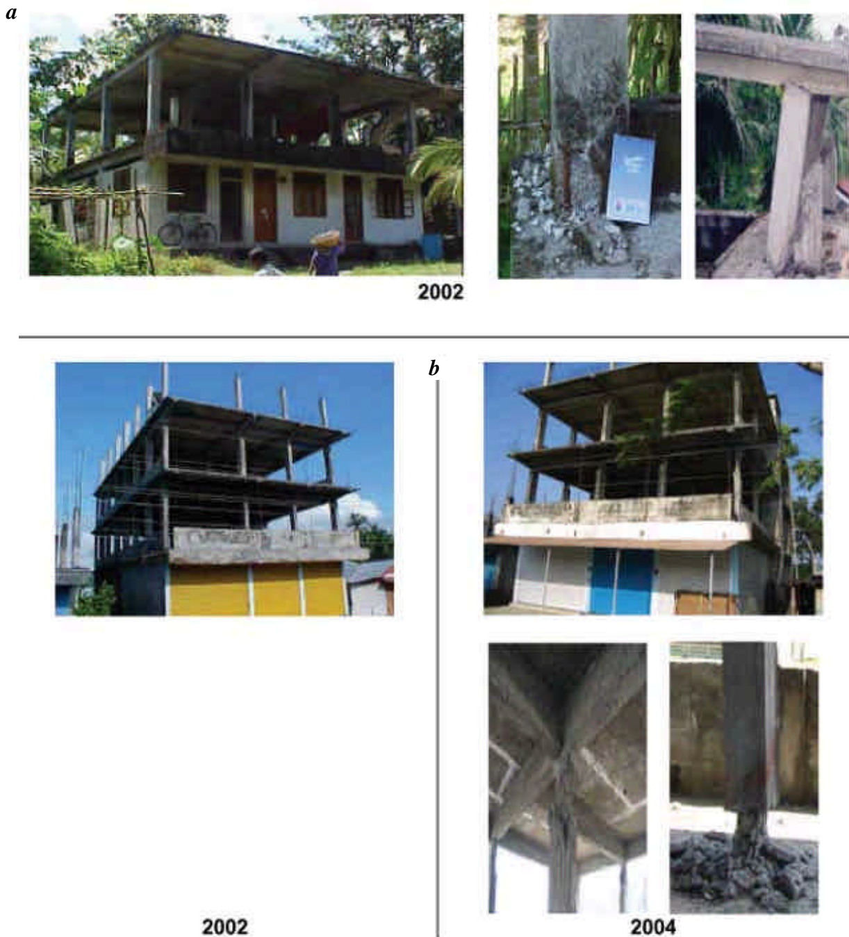
Figure 5. Weak RC columns cannot safely resist even less than design level earthquake forces. a , Unfinished residential building in Keralapuram damaged in the 2002 earthquake developing ‘plastic-hinges’ at the base of second story column due to inadequate strength. b , Unfinished three-storey building in Diglipur market which escaped damage in the 2002 earthquake, had severe damage to most of its columns in the second storey in the 2004 earthquake.

earthquake vividly illustrated the seismic vulnerability of this building to future shaking, no effort was made to remedy its seismic deficiencies; the damaged portions were simply ‘repaired’ after the 2002 earthquake. And, in the 2004 earthquake, the story was repeated.