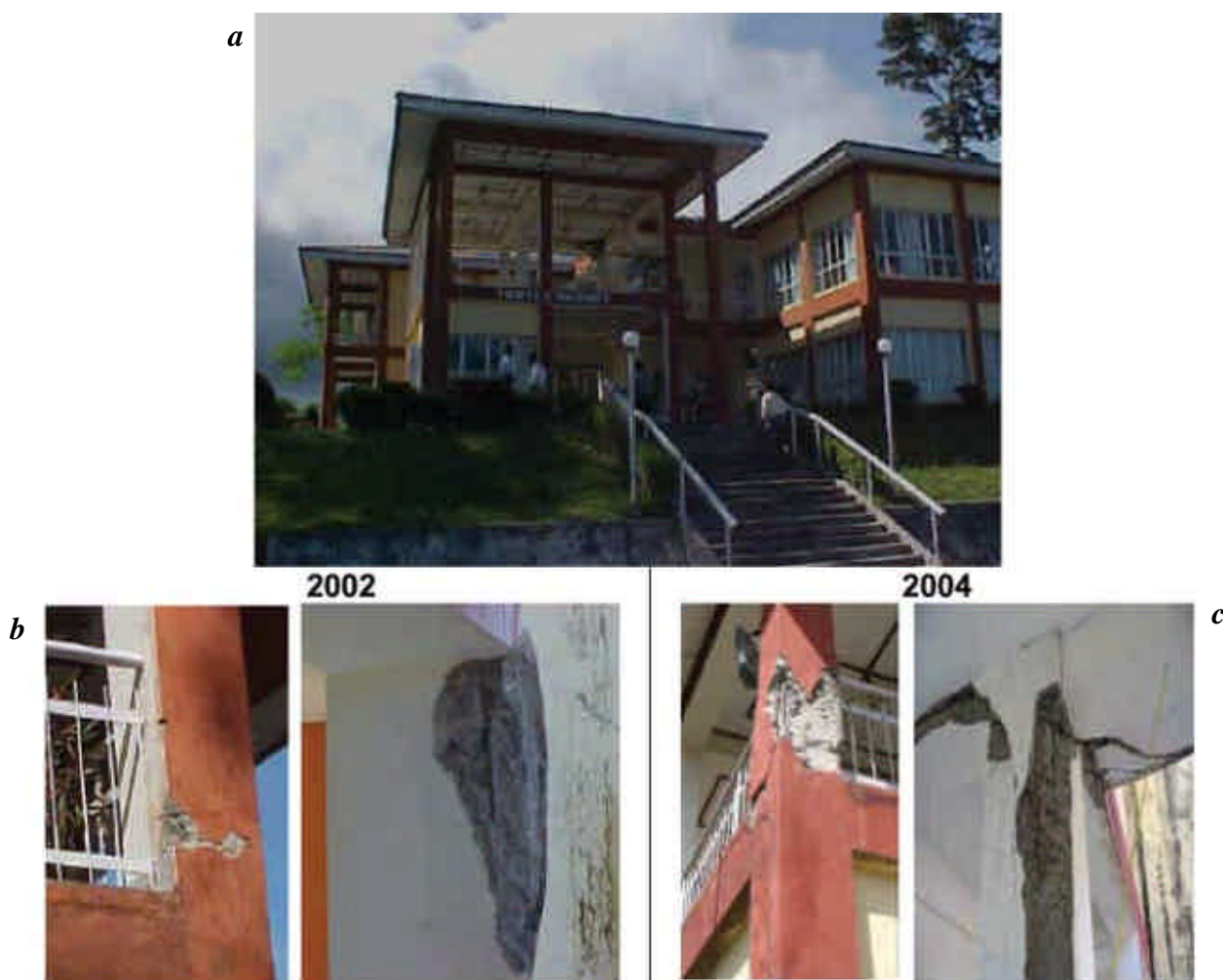
Figure 4. a , Turtle Resort building and highly irregular and asymmetric arrangement of structural members. b , Damage to columns which reveals absence of transverse ties over a length of about 450 mm from the beam soffit. This omission during construction compounded with poor structural configuration resulted in significant damage in less than moderate shaking of the 2002 earthquake. c , Repeat damage to columns in the 2004 earthquake, as no attempt was made to remedy the underlying structural deficiencies.

Secondly, the building was made susceptible to poor seismic performance by creating the open ground storey. Thirdly, the infills of partial height created short columns effect. Fourthly, the RC columns were not designed for earthquake forces and required ductility, particularly in the ground storey, where it was most needed. As a consequence, even a low intensity (VI on MSK scale) ground shaking was sufficient to seriously damage the structure and undermine its safety. The severely damaged columns of the building were simply repaired after the 2002 earthquake: the fine cracks were filled with mortar and the crushed concrete was replaced with hand-placed new concrete. No attempt was made to evaluate and remedy its overall seismic deficiencies; this left the building especially vulnerable to future earthquake shaking. And, during the 2004 earthquake, the building was again severely damaged and many columns in the ground storey were damaged. Further, the portion of the building close to the stiff stairwell was heavily damaged.