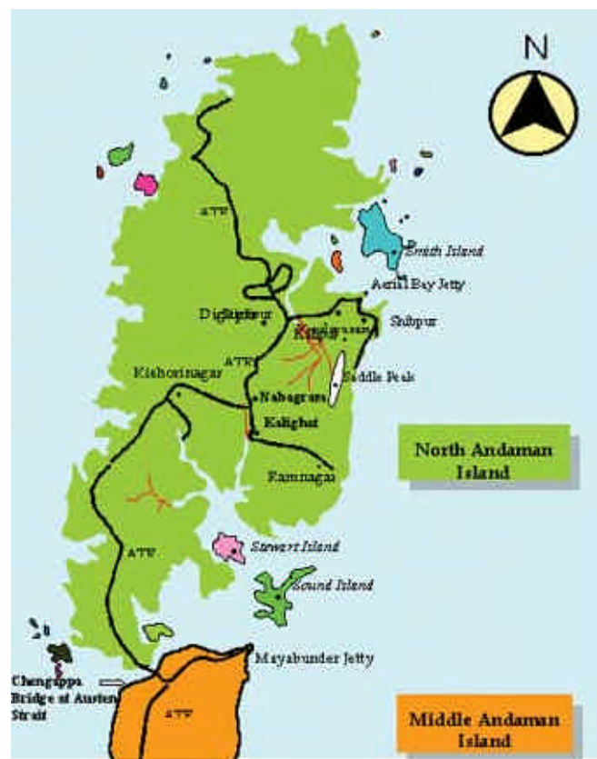
Figure 1. North Andaman Island experienced significant shaking of MSK VI to VII in the 2002 and 2004 earthquakes.

because these were similar to the non-seismic constructions that collapsed during the 2001 Bhuj earthquake in Gujarat.