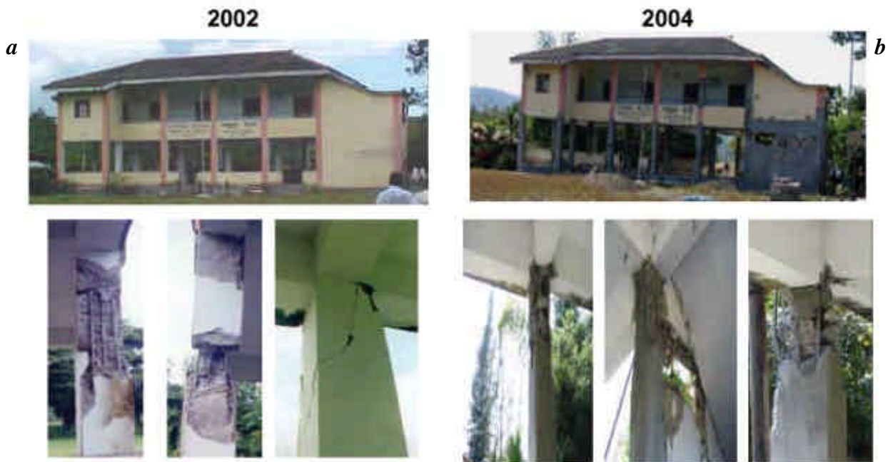
Figure 3. a , Severe cracking and damage to soft first storey columns of Nabagram Panchayat Bhavan building primarily due to 'missing' ties in the 2002 earthquake. b , More severe damage in the 2004 earthquake to the same columns which were 'retrofitted'.

In many instances, the masonry walls in the ground storey were discontinued at the sill level instead of being raised to the full storey height. This created the short column effect, an additional abnormality that was also not accounted for in the design. An example of such a structure is the Panchayat Bhavan building at Nabagram, about 25 km south of Diglipur (Figure 1). The ground storey columns of this building suffered extensive damage in the 2002 earthquake. Many columns were severely cracked and damaged near beam-column joints and at mid-heights (Figure 3). First, a close inspection revealed that no transverse