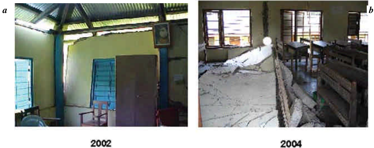
Figure 2. Slender masonry walls dislodged due to out-of-plane instability and poor or no connection to the surrounding structural elements.