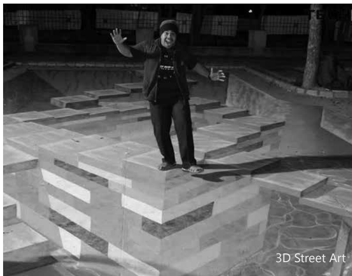
3D Street Art