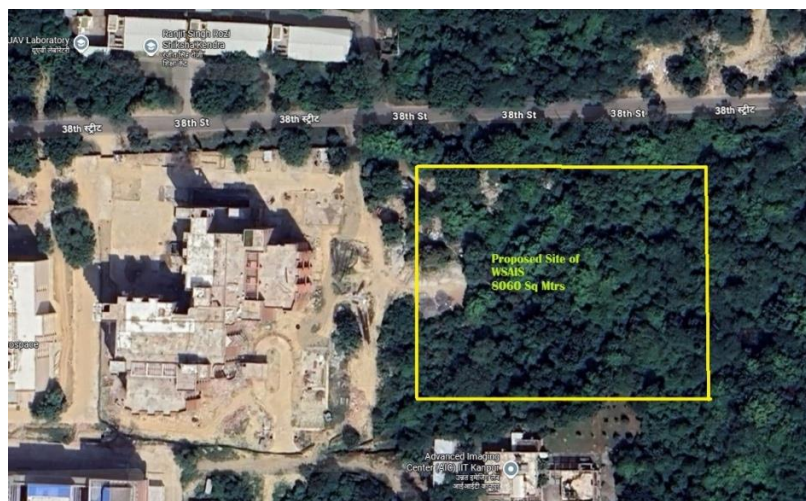
Pic-1: Location of WSAIS site

3.6 Site Context: The site is a contour-mapped land parcel on the main IITK campus, , admeasuring 8900 sqm., located towards the airstrip, adjacent to the Research Complex on the west and the Advanced Imaging Centre on the south, bounded on the north by Road no. 38 and on the east by a densely wooded area.