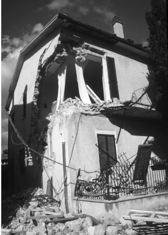
Figure 5. Civil building in Cesi (Macerata): overturning of the corner walls.