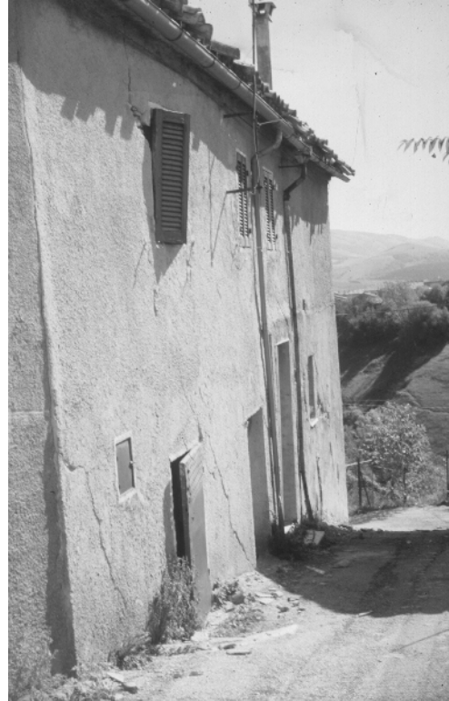
Figure 6. Civil building in Annifo (Perugia): simple diagonal cracks at the facade wall.