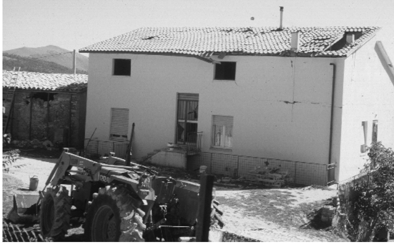
Figure 2. Civil building in Annifo (Perugia): damage of the structure of the roof and of the border elements connected to walls.