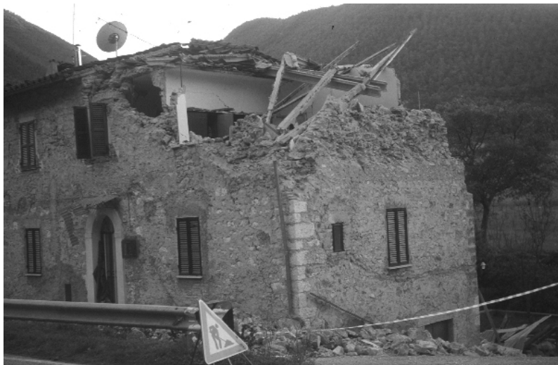
Figure 4. Civil building in Serrone (Perugia): collapse for overturning of the masonry walls supporting the roof.