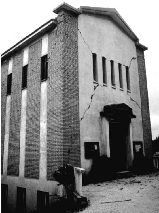
Figure 7. Church in Nocera Umbra Scalo (Perugia): double diagonal cracks at the facade wall.