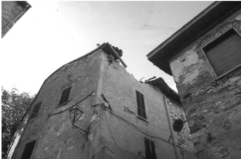
Figure 3. Civil building in Nocera Umbra (Perugia): collapse for overturning of the upper part of masonry panel supporting the roof.