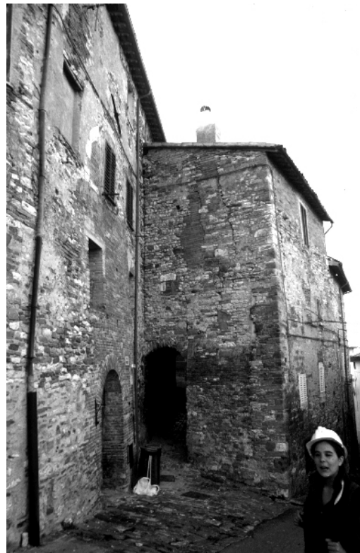
Figure 8. Civil building in Nocera Umbra (Perugia): vertical cracks in the wall due to the chimney-flue.