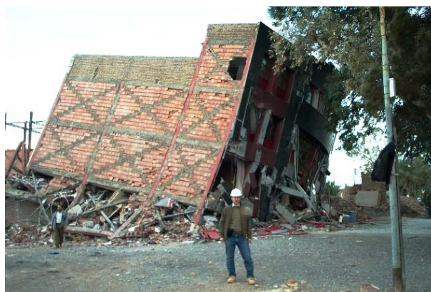
Figure 7: Kimia building in Bam

Figure 7 shows damage to Kimia Building which is a combined residential-commercial building with braced steel frames in Bam city centre. The building had 5 stories above ground towards the front but only 4 stories in the rest of the building. Two to three stories were flattened during the earthquake. This building is a typical example of the effect of geometrical, stiffness and mass irregularities which resulted in large lateral and torsional displacements. This combined with poor quality of welding have contributed to total collapse of the structure.