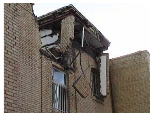
Figure 8: An Example of the performance of staircase extension structures in Bam

Failure of the rooftop extensions to staircase structures was common in the Bam Earthquake. The largest damage to these structures was seen in masonry buildings where the structure is merely an extension to the staircase walls and covered with a flat or inclined jack-arch roof spanning between the two side walls that run parallel to stair axis in plan. The other walls normally have large openings for a door to the roof top on one side and a window on the other side, which make the structure very flexible and weak in the direction parallel to these walls, unless a proper framing system is implemented. The weakness in this direction has resulted in detachment of the whole staircase extension from the building below, large movements and also instances of collapse. The use of vertical and horizontal ties does not necessarily provide sufficient framing for the staircase extension to resist the earthquake force in the direction perpendicular to the stair axis. Due to the importance of the staircase structures in providing safe evacuation from buildings, and since failure in these structures was a common occurrence in the Bam Earthquake the issue of proper design of these structures and the provision of clear design guidance needs to be considered by local authorities.