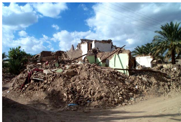
Figure 5: Total collapse of adobe buildings in Bam

Figure 5 shows an example of damage to adobe buildings in the Bam earthquake. Severe damage to total collapse was seen in Bam city and Esfikan village while in Nartij village most of the buildings were standing with only moderate damage with a smaller proportion suffering collapse. Although most of the buildings with vaulted roofs collapsed within the city,