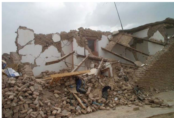
Figure 6: A residential masonry building without ties in Baravat. Construction finished about 6 months before the earthquake

Since the introduction of modern seismic design codes in Iran, masonry buildings are now required to have horizontal and vertical ties. The use of horizontal ties in Iran started in the 1960s and the use of vertical ties began in the 1970s. However this practice took much longer to be implemented in rural regions such as Bam. Many of the older masonry buildings in Bam have been constructed without ties and even some buildings, constructed as recently as six months before the earthquake, were found to be without ties. For masonry structures without ties observed main failure types include: a) horizontal displacement of simply supported joists in jack-arch system resulting in collapse of arches between the joist (b) horizontal movement and slippage of the whole roof system on the walls resulting in total collapse of the building. In addition, poor material properties and workmanship were a common factor and a contributory cause to the damage experienced by many structures. Mortar materials used in older masonry buildings are lime-clay, lime-sand or lime-sand-cement. Although in more recent construction sand-cement is predominant, lime-sand is still used in some private houses. An example of masonry building total collapse is shown in Figure 6.