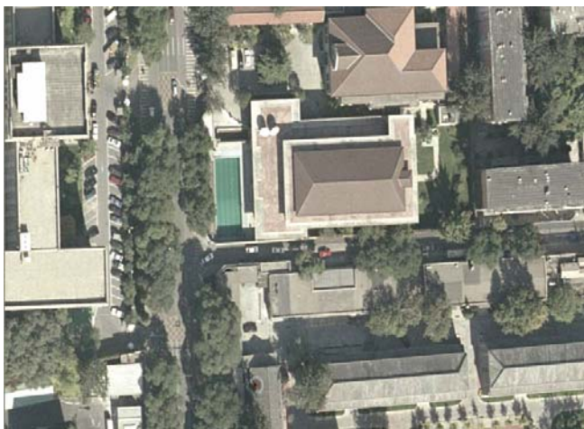
Figure 1 three-dimensional model of buildings

After setting parameters and survey area being set up, the model was set up and orientated. Nuclear-line was resampled and Nuclear-line image was obtained. A part of three-dimensional model of buildings is shown in figure 1. Buildings were measured by digital measure of DPS. Finally, the digital map with three-dimensional coordinates of buildings was obtained in the end and is shown in figure 2.