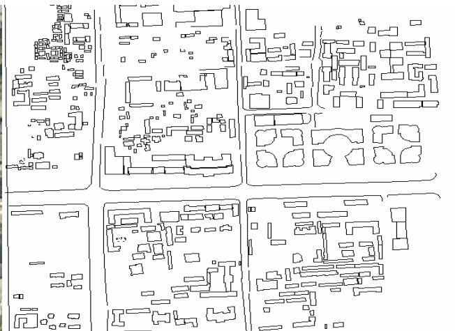
Figure2 results of the digital mapping

More than 600 buildings were digital measured in the digital test. The information of DSM and DEM and the types of building roof were obtained. The height of a building can be obtained by formula 2.1.