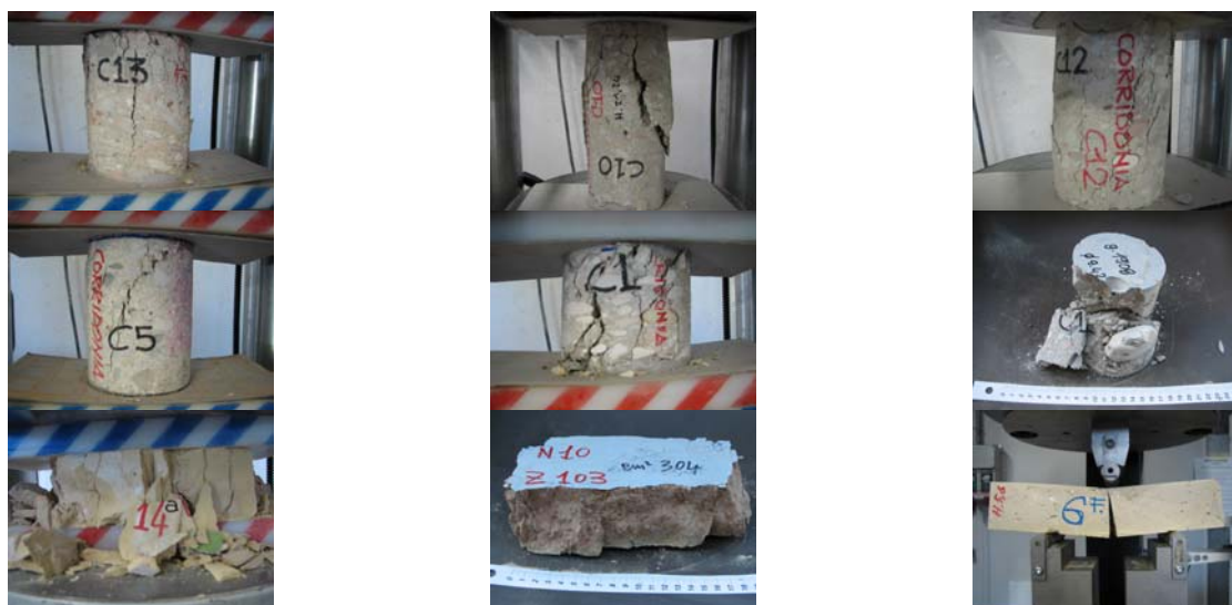
Figure 4. Compressive tests on concrete cores in clockwise order from up left from lower strength to higher strength (C5 f_c = 19.70MPa ); brick flexural and compressive (perpendicular or normal to mortar bed) tests