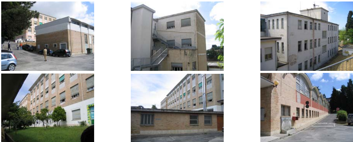
Figure 2. Views of IPSIA – Sant’Anna School complex in Corridonia in clockwise order from top left according to points of view in Figure 1

The complex is divided into two different administrative boards: the IPSIA Secondary School (A1, partially A2, A3, E, and F; for a total consistency of 6,500 m 2 and 26,500 m 3 ) and the Sant’Anna Primary School (partially A2, A4, B, C, D for a total consistency of 4,650 m 2 and 18,500 m 3 ).