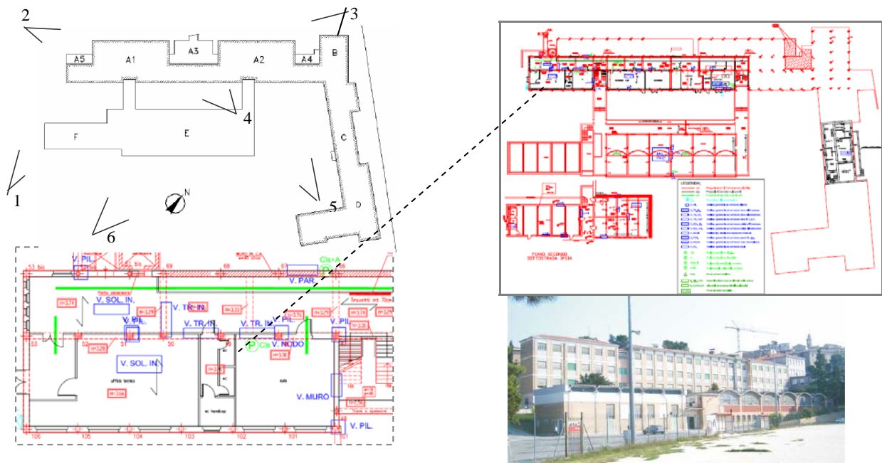
Figure 1. IPSIA – Sant’Anna School complex in Corridonia general plan with photo points of view and in details analysis (up side), partial sketch of structural details analysis at ground floor and general view (down)