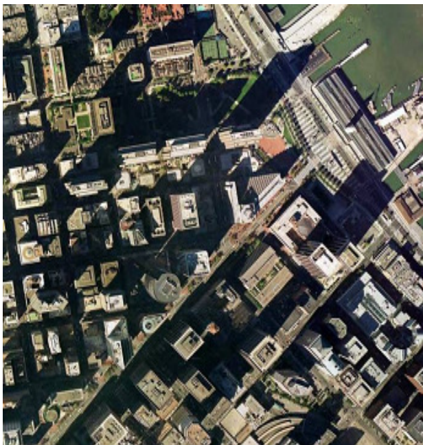
Figure 1. Satellite Image of Buildings

Using the average story height of typical buildings of the region, the number of stories of a building can be approximately derived. Finally, the total construction area of a building is calculated from its geometric shape and the number of stories. Once the building data is extracted from remote sensing images for the whole area, a comparison with the available existing GIS building inventory database of the region can provide information of new constructions in the same area.