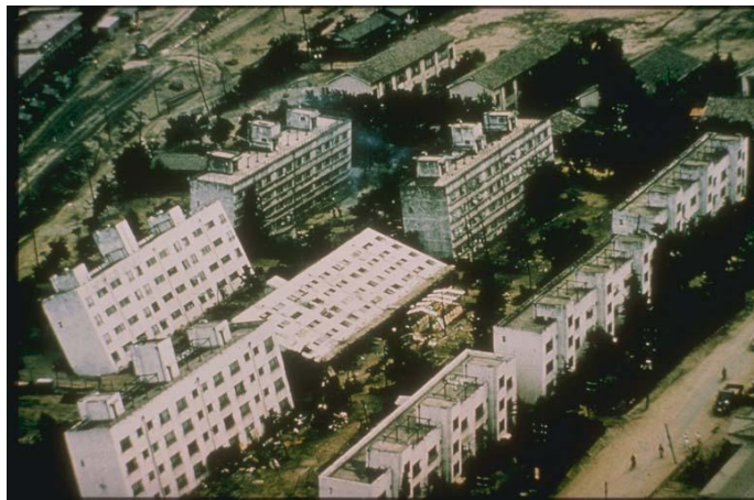
Figure 1 a) A building on slope failed due to excessive torsion during 2005 Kashmir earthquake . b) Failure of buildings due to settlement caused by seismic liquefaction during 1964 Niigata earthquake.