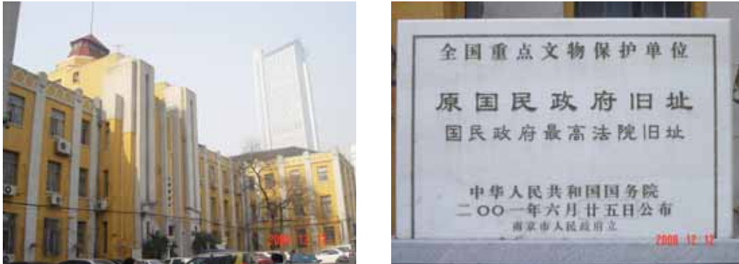
Figure 4 The National Government Supreme Court Building in Nanjing

The National Government Supreme Court building in Nanjing, built in the early 1930s, is one of the sites under state protection for key cultural relics. Because of the limitation of the construction technology at that time, the structure can not satisfy the requirements of the current service. According to the survey report by Southeastern University of China, there was a significant shortage of the load-carrying capacity and seismic detailing of the walls in the first and second floors. So to ensure their continuing service, all these walls need to be strengthened. The utility of the SMPM technique in this project has been proved by experts, Jiangsu Provincial Earthquake Resistance Office.