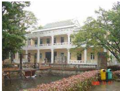
Figure 3 Zhongshan Nanyin Theater

Located at Zhongshan Park, Xiamen, Zhongshan Nanyin Theater has a history of about 100 years (Nanyin means a traditional opera in south China). Unfortunately, as a result of the poor maintenance and management over the years, a variety of problems were observed such as corrosion of the reinforcing bars, concrete cover peeling in columns, obvious cracks in beams and slabs as well as the brick wall erosion caused by humidity. Some of timber members were also found in decay. The seismic detailing and performance of the structure can not meet the requirement of the current Chinese code. On the other hand, there have been several alterations up to now, which made the main structure more complex and force transfer system more disordered. The Nanyin Theater is expected to be a public place for theatrical performance, so higher fireproof performance is required for the structure. Considering the Nanyin Theater is a historic building with an architectural style which exhibits the typical culture in south China, the appearance of the building shall not be changed or broken when strengthening. After analysis and feasibility study, several strengthening methods were used in which SMPM technique was strongly recommended in the strengthening of beams and slabs in the second floor and beams and columns in the side corridor.