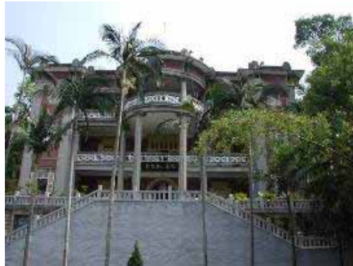
Figure 2 Xiamen Zheng Chenggong Memorial

and was protected by the local government for its historic value. This is a four-story masonry building, and has a cast-in-situ RC floor system. After its more 70 years' service, significant quality deficiency was found in the main structure. According to the analysis and survey report, it can not meet the requirement of the seismic fortification of Intensity 7 in Xiamen; even in the regular service condition, certain security risks also exist. For the strengthening of this historic building, experts believe that the existing methods can not satisfy the demand for "rebuilding it as it was" as well as fireproof and environmental problems. However, SMPM technique was able to solve these problems and improve the load-carrying capacity of the structural members. So, in the project, SMPM was applied to the strengthening and rehabilitation of the brick walls and part of the concrete beams and slabs.