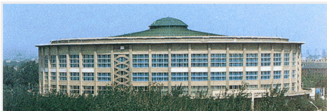
Figure 5 Beijing Workers' Gymnasium

Beijing Workers' Gymnasium, located at the Gongti West Road in the Chaoyang District, Beijing, was founded in 1959. It is one of the top 10 buildings in 1950s in China. It is a frame & shear-wall building with total covered area of 40200m 2 and the height of 26.8m. It was designed by Beijing Institute of Architectural Design(BIAD), and the structural design mainly followed the former Soviet Union code "Design Standard and Technical Code for Concrete and Reinforced Concrete Structures"(HnTy123-55) without consideration of the seismic action. The material properties, structural details, seismic fortification and other aspects of this building can not satisfy the provisions of the current Chinese codes. Also, the structure can not meet the requirements of the regular service because in the detection injuries and ageing were found in many parts or components of the structure after its almost 50 years' service. Taking various factors into account and comparing several commonly used strengthening methods, finally SMPM technique was adopted for the strengthening of the RC beams and slabs whose load-carrying capacity were inadequate.