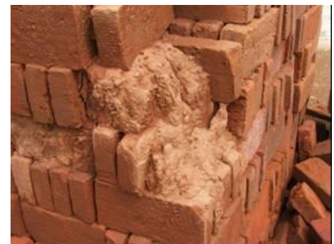
Figure 5 Melting bricks

The quality of bricks used in the area is very low. The lowest class of bricks in the Indonesian code is Class III, which requires strength of minimum 25 kg/cm 2 . Most bricks fall below the minimum strength and even "melt" when soaked with water (Figure 5). The mortar quality is also questionable because of poor composition: too little cement and too much water. The bricks observed at construction sites were not installed in straight lines and mortar was often excessive (spacing of more than 15 mm).