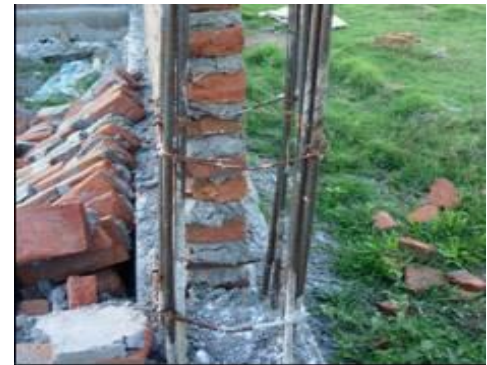
Figure 4 Widely spaced hoops

construction sites, even weaker reinforcements were found: diameter 8 mm for longitudinal plain rebars and diameter 4 mm for hoops. The Indonesian seismic code specifies the following minimum diameters for materials to be used in earthquake resistant buildings: 12 mm for deformed bars for column longitudinal reinforcements, 10 mm for deformed bars for beam longitudinal reinforcements, and 8 mm for plain bars for hoops. Most of the reinforcements found in the field survey violated the building codes. Even worse, detailing of reinforcement such as bending work does not satisfy seismic demands for safety. Figure 3 shows the contrast between the drawing (the intended design) and the actual situation, a difference that is quite common in the area.