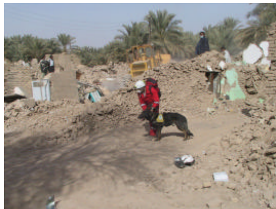
Figure 2 Blockage of narrow roads by debris after Bam earthquake of 2003

Most of the old urban areas suffer from narrow roads and alleys. This situation not only may cause difficulties for transportation in normal condition, but also would affect the emergency response activities after earthquakes due to blockage of existing roads by debris. Based on the current regulations in Iran for classification of vulnerable areas among old urban zone, the areas having narrow roads (less than 6 meters width) normally are considered as vulnerable urban tissues. Almost all the big and historical cities of Iran have some narrow roads and it is expected that most of them would be damaged or blocked by potential earthquakes. In Bam earthquake nearly all the narrow roads in historical parts of the city were completely blocked and it caused considerable delay in rescue and relief operation for several hours (figure 2).