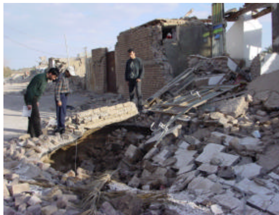
Figure 4 Sinkholes caused severe damages to the buildings in Bam Earthquake

Geological hazards such as liquefaction, landslide or rock fall, land subsidence, fault rupture that can be induced or triggered by earthquake motions may increase the vulnerability level of urban tissues. During the Manjil earthquake of 1990, a big landslide covered one part of the city of Manjil, called Fatalak, and almost 100 persons were buried under the debris. In addition during Bam earthquake of 2003, land subsidence due to collapse of Qanats (underground irrigation units) caused severe damages to several buildings and lifelines (Amini Hosseini et al, 2004) as shown in figure (4). These examples shows that the urban tissues located in geological hazard zones normally will experience more severe damages in earthquakes so the vulnerability of these sites are much higher than the similar tissues located in other areas.