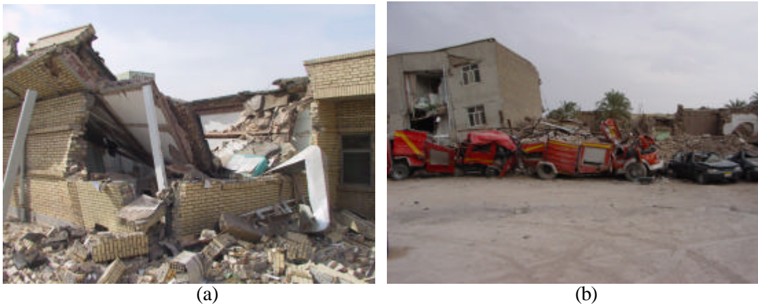
Figure 5 Damages to Imam Hospital (a) and a fire station (b) during Bam earthquake of 2003 caused delay in rescue and relief activities