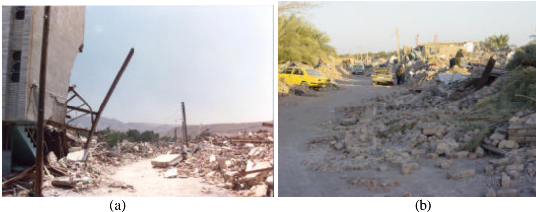
Figure 1 Damages to the weak buildings during (a): Manjil, 1990 and (b) Bam, 2003 Earthquakes

This subject is the main cause of the vulnerability of urban areas during earthquakes. Especially in old urban tissues, most of the buildings suffer from lack of resistance to earthquake shaking as most of them were built decades ago without considering any seismic codes or criteria. In both cases of Bam (2003) and Manjil (1990) earthquakes, almost all of the weak buildings were collapsed or severely damaged by shaking. Figure (1) shows some of these damages.