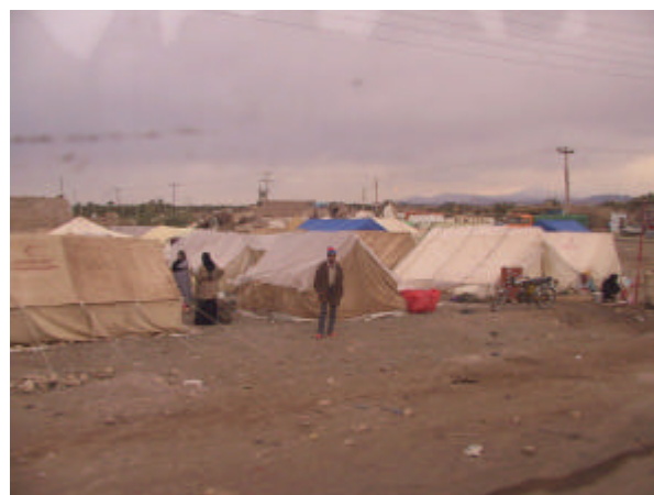
Figure 6 One of the evacuation places prepared after Bam earthquake of 2003

Evacuation is an important issue for reducing the casualty of earthquakes. It could be considered before an earthquake (by feeling some foreshocks or using modern early warning system) or after an earthquake (when there is the risk of fire or collapse of building by aftershocks). In both cases if the people could not be properly evacuated to safe evacuation places through proper evacuation routes, more serious human casualties will be expected. So allocating of the safe evacuation places before an earthquake can reduce the vulnerability level of urban tissues in risk reduction and can be considered for classification of urban tissues in earthquake prone areas. In the previous earthquakes in Iran, the lack of sufficient evacuation places to be used in different weather condition caused serious difficulties especially in Bam case. In that event although the people felt some foreshocks, but due to cold weather condition they could not stay outside of their houses. In this case even after the earthquake lack of proper places for evacuation, caused several peoples be accommodated into tents in not proper places (figure 6).