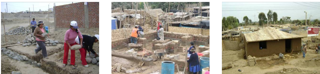
Fig.8 Building reinforced adobe houses

Classroom lessons had 6 hours duration, given in two days. They included a presentation of the instructional video developed in Phase 1. Practical lessons followed the “learning by doing” approach. The participants actually helped building a complete house, following each step of the instructions given in the construction manual, as shown in Fig. 8. Three houses were built in each city, each in a different neighborhood, to facilitate the participation of a wider number of people. The model houses were given to families selected by the community, which had lost their house during the earthquake and did not have the resources to rebuild a new house. The training program will be extended to 4,000 families affected by the earthquake, in Chincha with funding from OFDA (Office of U.S. Foreign Disaster Assistance) and in the provinces of Huaytará and Castrovirreyna in Huancavelica with funding from CIDA (Canadian International Development Agency).