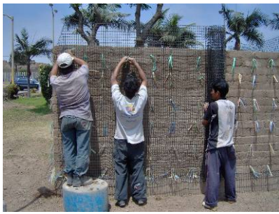
a) Geomesh placement