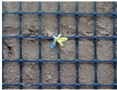
b) Geomesh and plastic tie