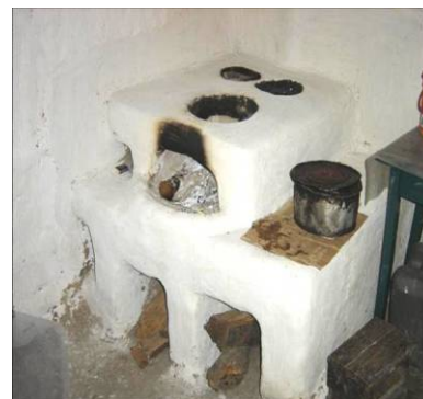
Fig. 4 Improved firewood stove