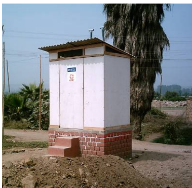
Fig 3 Dry hole latrine

The seismically safe house includes a dry hole latrine and an improved firewood stove to provide basic sanitation facilities to its dwellers. The latrine (Fig.3) is a hygienic facility to contain human excreta. Its correct construction, location and usage will contribute to avoid environmental contamination and to preserve the health of the dwellers. The building and installation cost of a single latrine is about US$ 130. The improved stove (Fig.4) uses less firewood than traditional stoves. It has good ventilation and low smoke emissions, thus preventing respiratory illnesses caused by excessive firewood smoke. It can easily be built by any family, as its design is very simple, and its cost is minimal, as it is made with local materials.