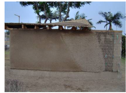
c) Reinforced adobe wall