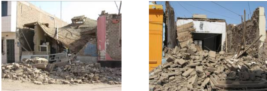
Fig. 1 Adobe dwellings destroyed during Pisco earthquake