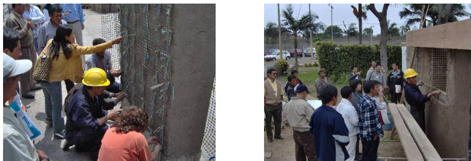
Fig. 7 Practical training classes

During the practical lessons, each step of the construction was carefully explained with the aid of the demonstration module and a practice adobe wall, which included the attachment strings in such a way that each group had the opportunity to practice attaching the geomesh to the adobe wall and plastering the wall with mud (Fig. 7). At the end of this training phase, each participant received a certificate.