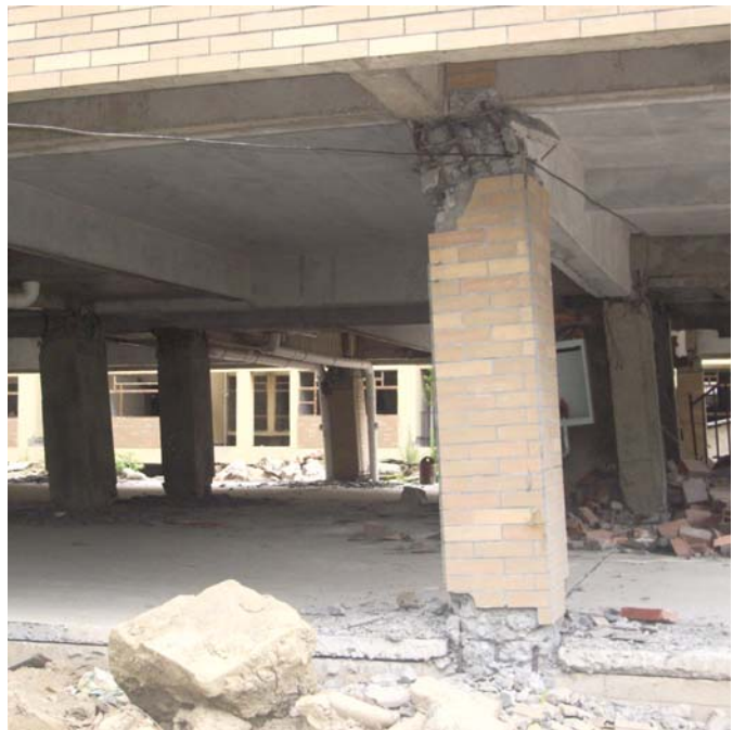
Figure 4: Six-storey RC MRF in Yazhouyan housing development, Dujiangyan that is exhibiting a soft-storey failure mechanism at ground storey (detail of ground floor columns, right)

The performance of the mid-rise RC MRF varied substantially according to location. However, in any single location, no difference was observed between the performances of buildings built to different codes, due to the predominance of soft-storey type failure. For example, the Yazhouyan housing development in Dujiangyan composed of 27 buildings between 4 and 6 stories in height. Construction of these buildings began in 2006 and some were still under construction at the time of the earthquake. These structures are founded on very stiff soil with driven pile foundations of 300-400mm diameter and 900kN maximum axial capacity. Although designed to the most recent Chinese seismic code, about 70% of the structures had suffered some degree of damage with many suffering soft-storey failure at either the ground or first floor, mainly due to non-consideration of the added stiffness due to the presence of infill. Figure 4 shows a typical example where this type of failure was also precipitated by the presence of reinforcement bar splices in plastic hinge zones and inadequate confinement reinforcement. Overall, RC MRF performed well outside the immediate fault zone, and achieved life-safety performance despite the fact that the reported felt PGA's are much larger than the design values for the area. In locations very near the fault zone, instead, they did not achieve life-safety performance.