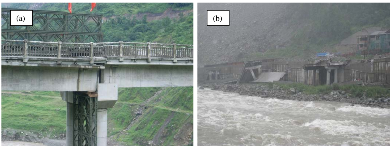
Figure 7: Damaged Bridges (a) Longitudinal displacement of simply supported beam at Shoujiang Bridge (b) Collapsed bridge along Mingjiang River in Ying Xiu Town

Infrastructure damage observed was primarily due to a combination of ground surface rupture and strong ground shaking. Stretches of the roads and highways from Dujiangyan to Wenchuan were inspected and were seen to have been blocked by rock falls and landslides. At the time of the EEFIT field visit, some of the damage had been repaired, while an alternative temporary route had been constructed next to the severely damaged roads and bridges. The EEFIT team visited two dams during the field investigation. The Zipingpu dam was one of these, and located 10km east of the earthquake epicenter. The dam had recorded a maximum vertical settlement and horizontal displacement of 80cm and 30cm, respectively. Cracks of 2cm width and a few meters long were observed on the concrete facing. Deconstruction of the masonry facing on the opposite side of concrete facing was seen. At the time of earthquake, the stored water only reached one third of designed capacity. The discharge of the reservoir was ordered immediately after the main shock in order to minimize the potential risk to nearby towns and cities.