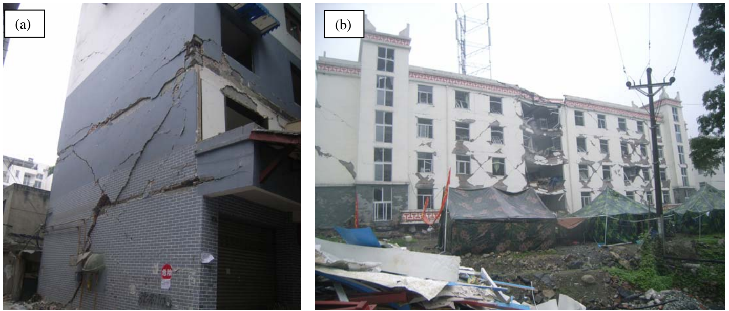
Figure 5: (a) 5-storey confined masonry building in Dujiangyan with shear cracks on bearing walls, (b) 5-storey masonry school building in Ying Xiu partially collapsed