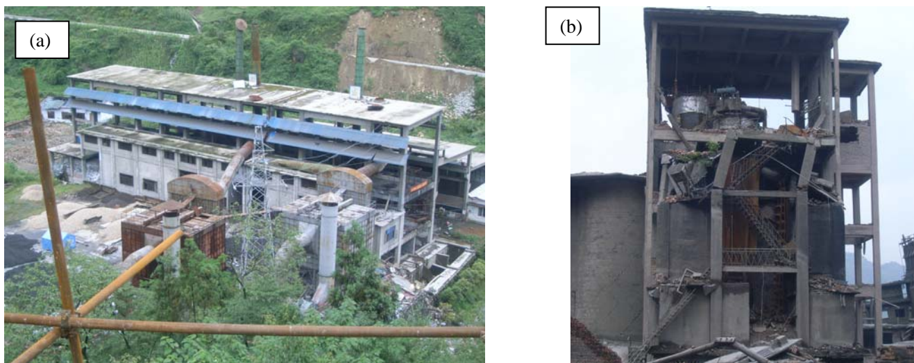
Figure 6: Damaged cement factories in (a) Ying Xiu and (b) Xiao Yu Dong

The Sichuan Province is a growing region with several multi-national companies as well as local businesses having their manufacturing facilities set up around Chengdu. These manufacturing facilities, which are modern, built perhaps over the last 20 years, appear to have suffered no damage or production losses as a result of the earthquake. This may be attributed to the distance from the epicentre, which is about 80-100km in the metropolitan area of Chengdu.