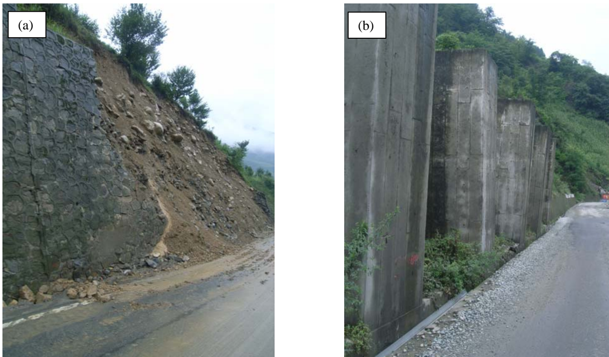
Figure 3: (a) Collapsed section of stone facing gravity retaining wall near Ying Xiu (b) Displaced section of RC bored pile retaining wall stabilizing a pre-existing landslide to protect the road, near Ying Xu

A variety of earthworks types were observed, which were used to stabilize the cuttings made for the mountain roads. The earthwork types observed were rock anchoring systems, soil nail walls, gravity retaining walls, reinforced concrete flexural retaining walls and face protection systems using cement sand mix with possible grout injection. The geotechnical structures have largely performed well during the earthquake. Gravity retaining walls made of cemented stone blocks did not perform well at certain sections. The walls were constructed with breaks at about 15m and these sections collapsed often resulting in a shallow landslide of the retained soil. Figure 3(a) shows such a slide on a major route near Ying Xiu. The gravity retaining walls are susceptible to failure due to prolonged exposure to wet weather if the drainage holes were blocked. A bulged section of a gravity retaining wall was found near Ying Xiu, where it is likely to fail due to further wet weather or due to an aftershock. Reinforced concrete retaining walls have performed well from those observed during the survey. Figure 3(b) shows an RC bored pile retaining wall stabilizing a pre-existing landslide and only experienced a stable head displacement of about 15cm, hence the road was unaffected.