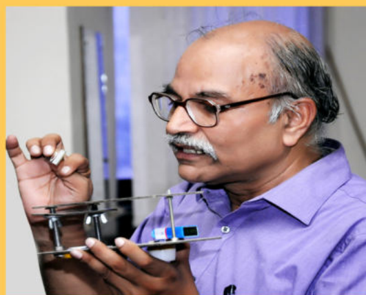
Prof. H.C. Verma

Prof. Verma is Currently an adjunct faculty with CCE and working towards popularizing science education in India using Hindi as a medium of instruction