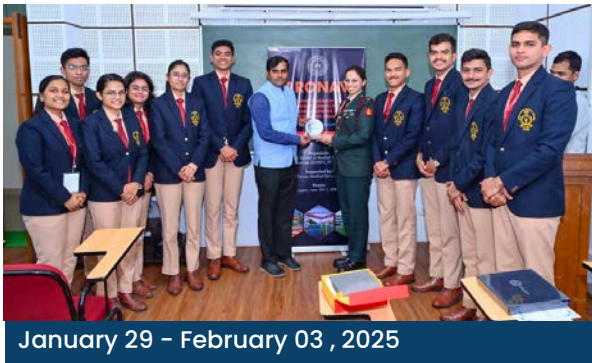
January 29 - February 03, 2025